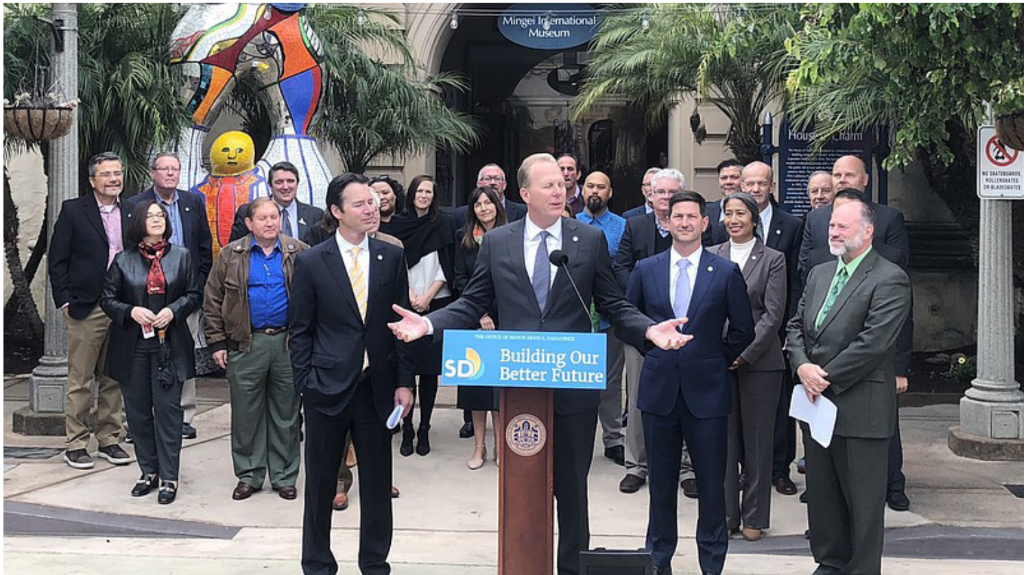
San Diego Mayor Kevin Faulconer speaks at a podium outside of the Mingei International Museum in Balboa Park, May 1, 2018.