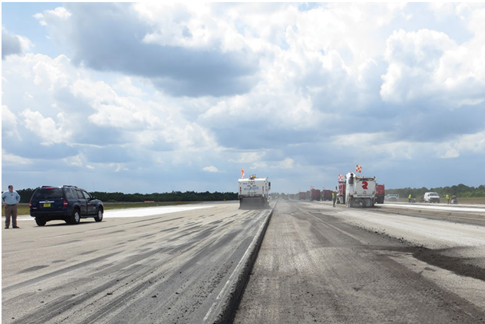
Industry hopes Senate will top House's $3.35 billion a year for the Airport Improvement Program, for runway and other projects.

A bill to extend the Federal Aviation Administration programs, including the agency's airport infrastructure grants, through 2023 has cleared an important hurdle with overwhelming approval by the House. Construction officials are focusing intently on the legislation because it is one of the few major infrastructure measures with a chance of enactment this year.